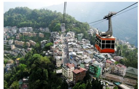
Ropeway Ride Over Gangtok