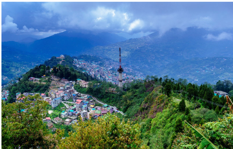
Bird's Eye View of Gangtok

Chungthang, Lachung, Pelling, Ban Jhakri Waterfalls, Kupup Lake, Gurudongmar Lake, Lachung Monastery and Pemyangtse Monastery are some of the other major tourist attractions near Gangtok.