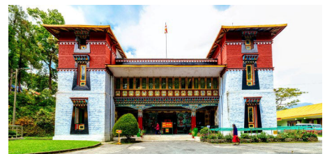
Namgyal Research Institute of Tibetology