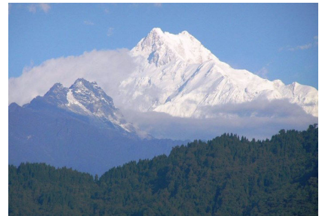
Kangchenjunga Viewed from Gangtok